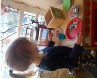
The Bambinos Approach