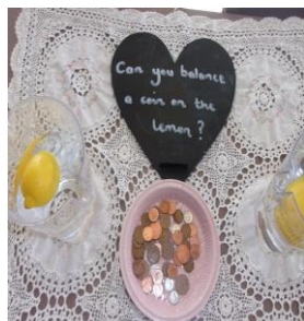
The Bambinos Approach