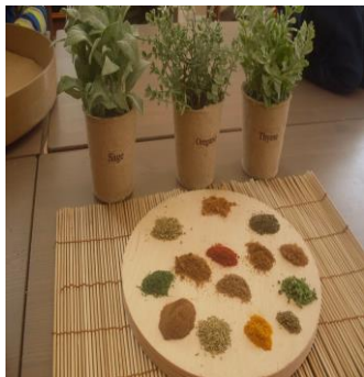
The Bambinos Approach