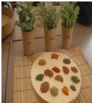
The Bambinos Approach